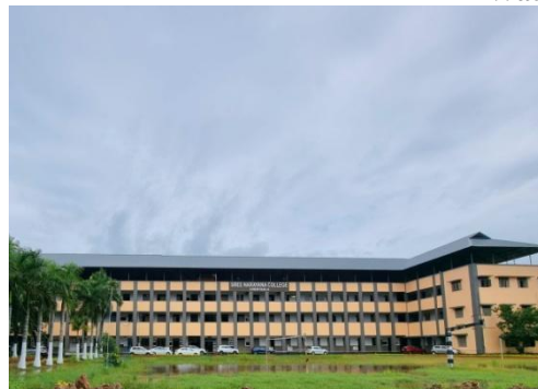
Truss work in main block