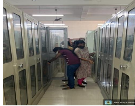
Newly purchased almirahs