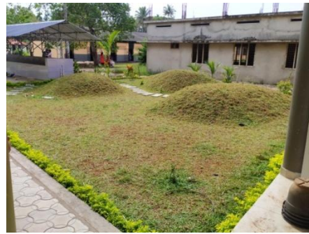
Landscaping near the library