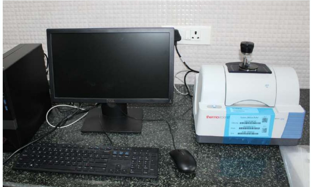
FTIR with Diamond ATR