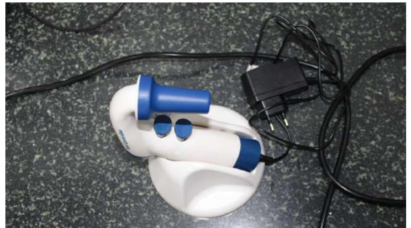
Motorized Pippette Filler