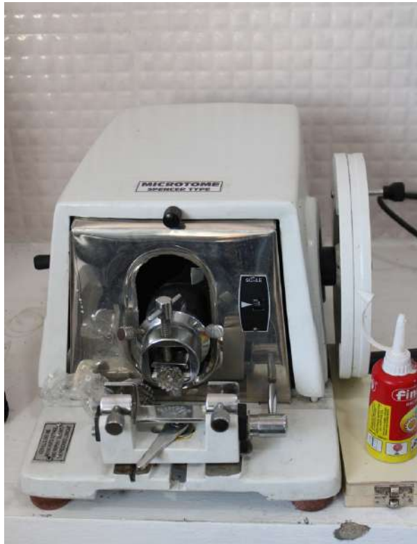
Manual Rotary Microtome