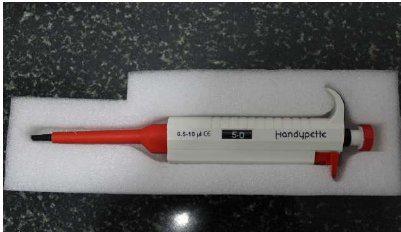
Single Channel Adjustable Volume Pippette