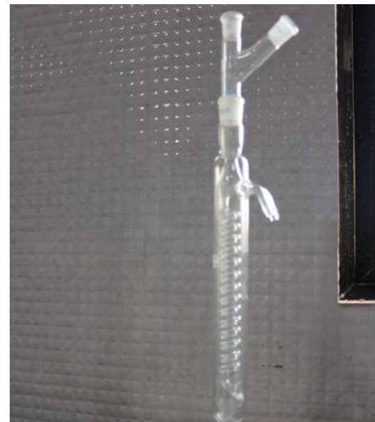
Steam Distillation Assembly