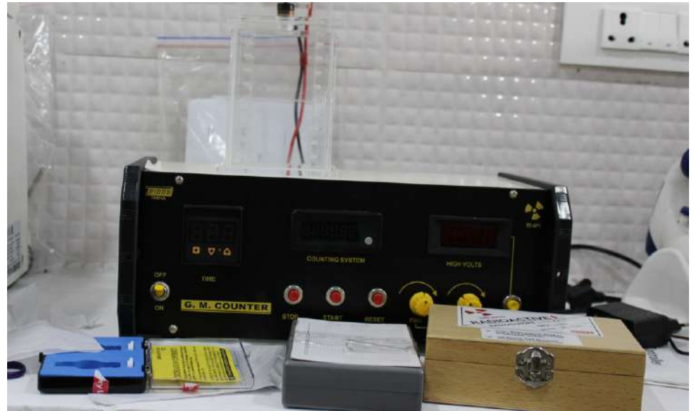
G M Counter