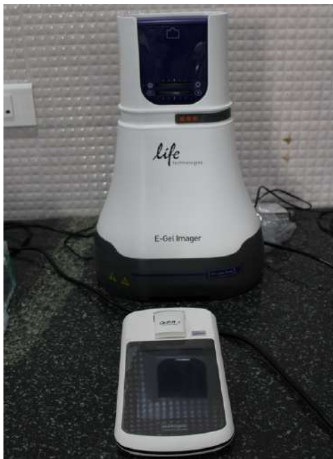
Gel Doc System with Fluorometer