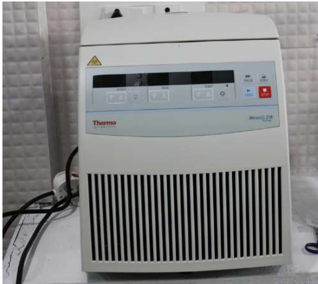
High Speed Refrigerator Centrifuge