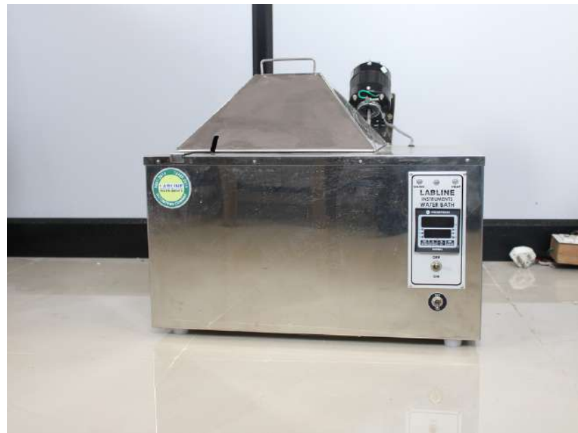
Stirred Water Bath