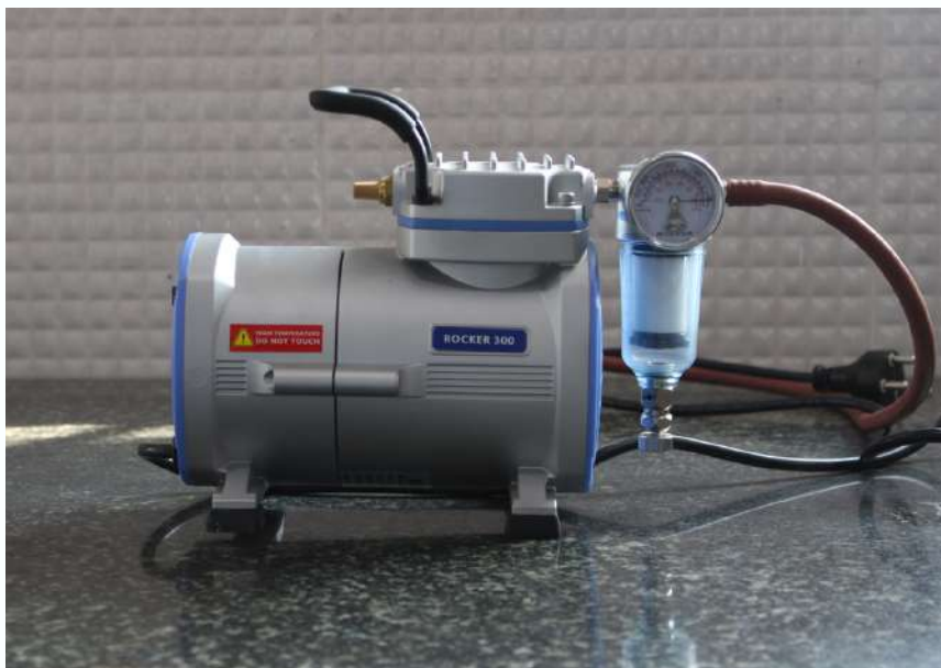
Oil Free Vacuum Pump