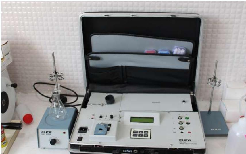
Water Quality Analyzer