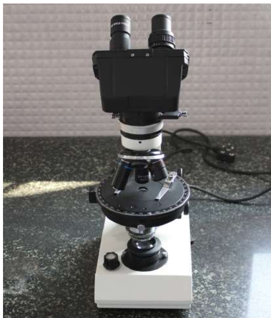
Binocular Polarizing Microscope