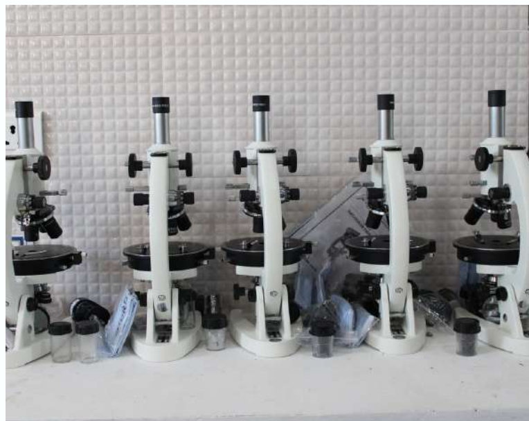
Monocular Polarizing Microscope