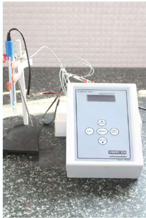
Digital Conductivity TDS Meter