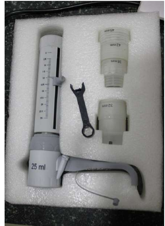
Bottle top Dispenser